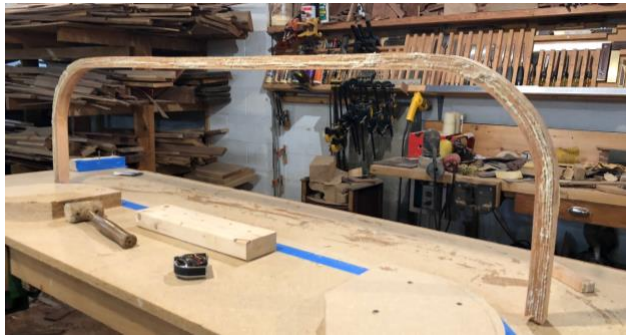
ABOVE, a bow is prepared in the Snyders' workshop.

DURING our monthly meeting on April 18, participants were treated to a presentation by Ken and Rob Snyder, who took time out of their busy schedules to give a demonstration on their techniques used to make wood bows. A couple of fast-motion videos were made by Ken Snyder and projected at the meeting, showcasing the process of how bows are prepared and bent into shape. Bows are commonly used as roof supports in cars and the Snyder's offer a cost-effective alternative to some of the other options in the area. A special 'thank you' goes out to Ken and Rob Snyder for a wonderful presentation!