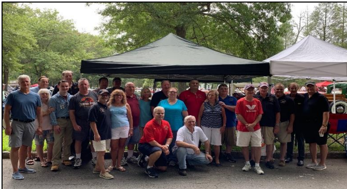
ABOVE, a sampling of club members present at the Allaire State Park car show pose for a group photo.

T HE 24th Annual Rolling Iron Antique Auto Show held at Allaire State Park on August 18 th brought another win to AMCOMC for the 'Most Participated Car Club' with 42 member cars present. This is the club's first win at the Allaire show. Many club members took home awards for their vehicles as well, making this event one of our most awarded shows yet. Thanks to all who attended and showed off our club's logo on your vehicles, your shirts, and in your conversations.